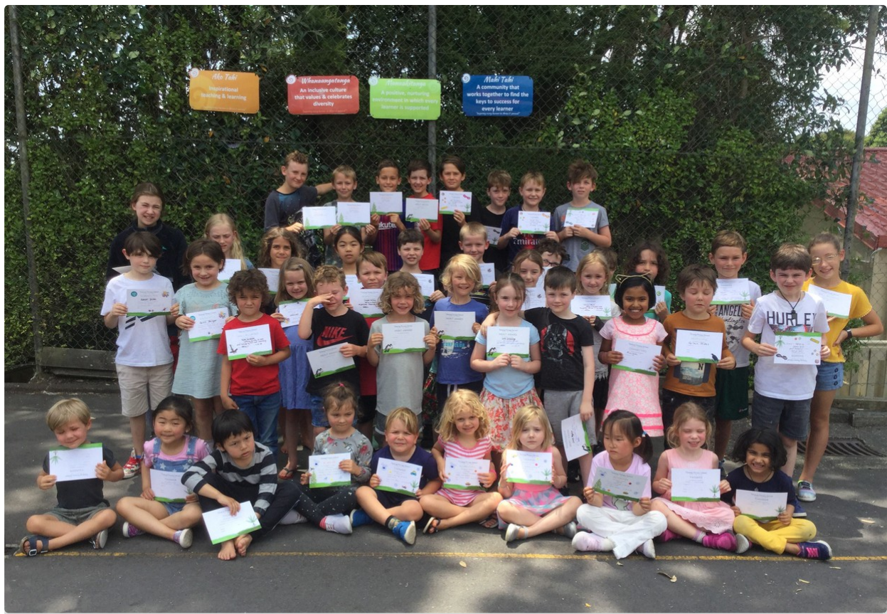
Merit Awards Week 9 - Term 4, 12th December 2019